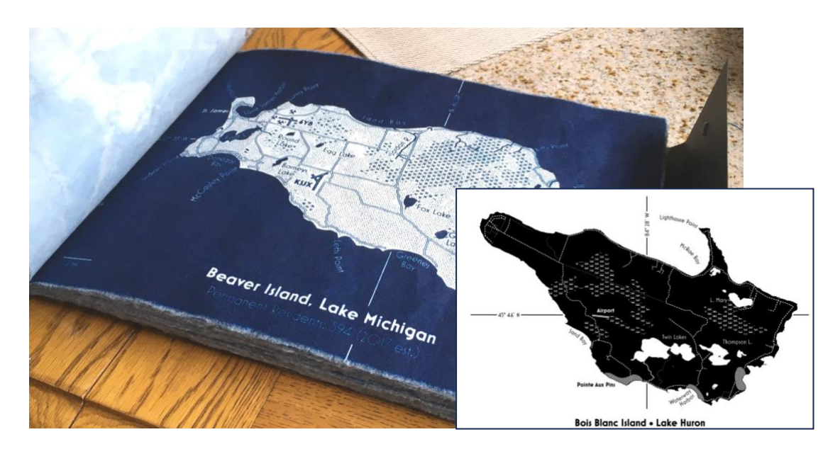
Figure 3. Hand-printed and hand-bound Atlas of Great Lakes Islands by Daniel Huffman (inset: part of the digital design process). For more of the process see https://somethingaboutmaps.wordpress.com/2020/01/07/something-of-myself/.