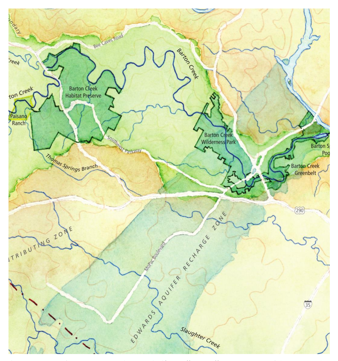
Figure 1. Excerpt from Barton Creek Watershed by Molly O'Halloran. Courtesy of the cartographer.