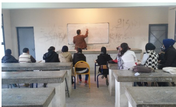
Figure 1. Some moments from the workshops.

The first meeting involved a general presentation of the project and the illustration of curricular links between the workshop activities and the geography study programme (Figure 1). Particular emphasis was given to how images can help to get to know both familiar and distant places. Later, all the pupils were asked to think of and share, first in writing and then orally, a story from their everyday lives (Figure 2). In other words, they had to come up with a short