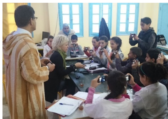
Figure 3. Technical training on the use of digital cameras.

This made some topics emerge: the question of the transformations underway in the two different neighbourhoods; their circumstances of hardship and precariousness, pollution and environmental degradation; the conditions and processes of the artisan work (from metal processing to the tanneries, from slipper manufacture to pottery); but also the beauty of the architectural heritage, and the savoir-faire involved in the manual skills required by the cottage industries.