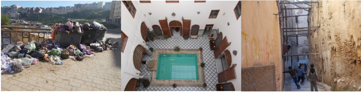
Figure 5d, 5e, 5f. Examples of photographs taken by the pupils in Ain Nokbi.

In these cases, the photographs were used consciously as a means to express their points of view, worries and the historic city's contrasts: for example, Niad (aged 13) photographed the building sites and workers at work, sceptically wondering "why is this work being done?"; Zineb (aged 13) and Mohammed (aged 14) compared images of houses and dangerous and degraded buildings with the Ryad and the monuments restored for the tourists (Figure 5d and 5e); Soukaina (aged 13) captured the environmental decay caused by the abandonment of urban waste in the streets (Figure 5f).