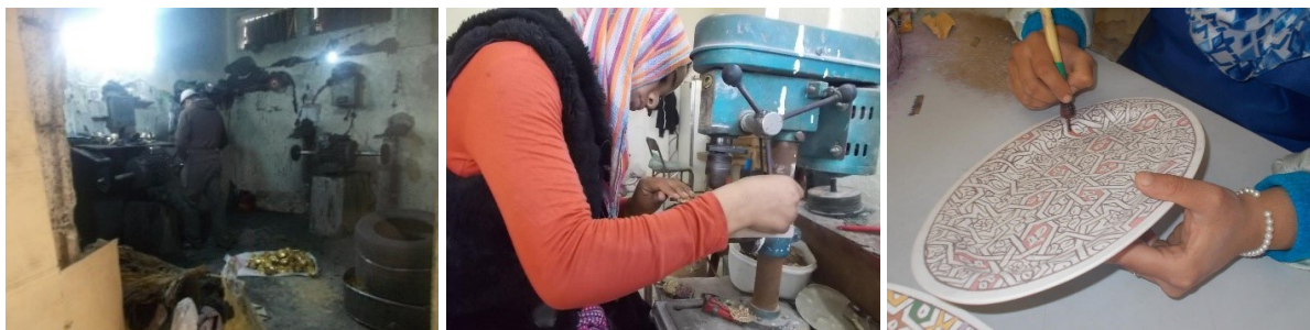
Figure 4a, 4b, 4c. Examples of photographs taken by the pupils in Ain Nokbi. Photo by the the students, 2015.

The shots of the gestures and decorations manage to grasp and express a grace and artistic beauty (Figure 4b) which is in clear contrast with the unhealthy and unsafe work environments where the jobs are done (Figure 4c).